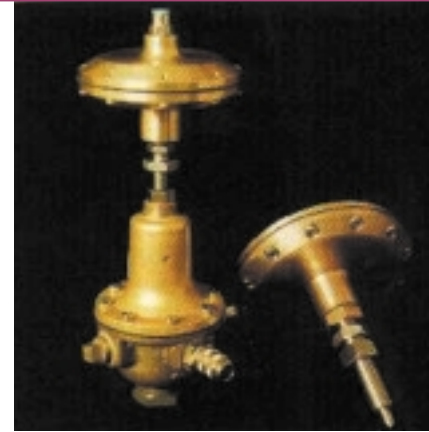
Hydraulic Actuator with Cla-Val pilot

The availability of the Hydraulic Actuator eliminates two of the main technical weaknesses associated with the use of "bias" chambers (or dual-chamber pilots in older controllers). Firstly, it is no longer necessary to use a so-called MRA (a small pressure regulator) to generate an intermediate pressure to carry out a 2-point control function. Secondly, using the Hydraulic Actuator with its built-in mechanical minimum setting, there is no longer the possibility of valve closure due to electronics failure, operator error, leakage of the MRA, etc.