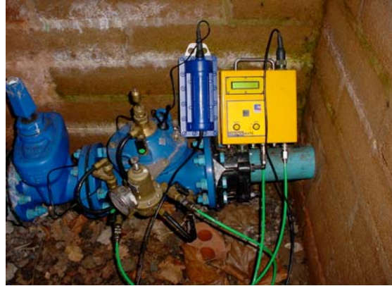
ControllerCom connected to ControlMate

A range of external battery packs is available to allow the anything up to full 24-hour instant access.